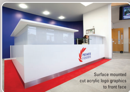
Surface mounted cut acrylic logo graphics to front face